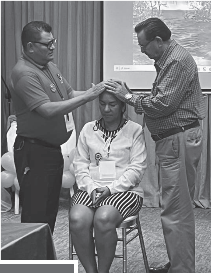
Honduras Remote Caucus