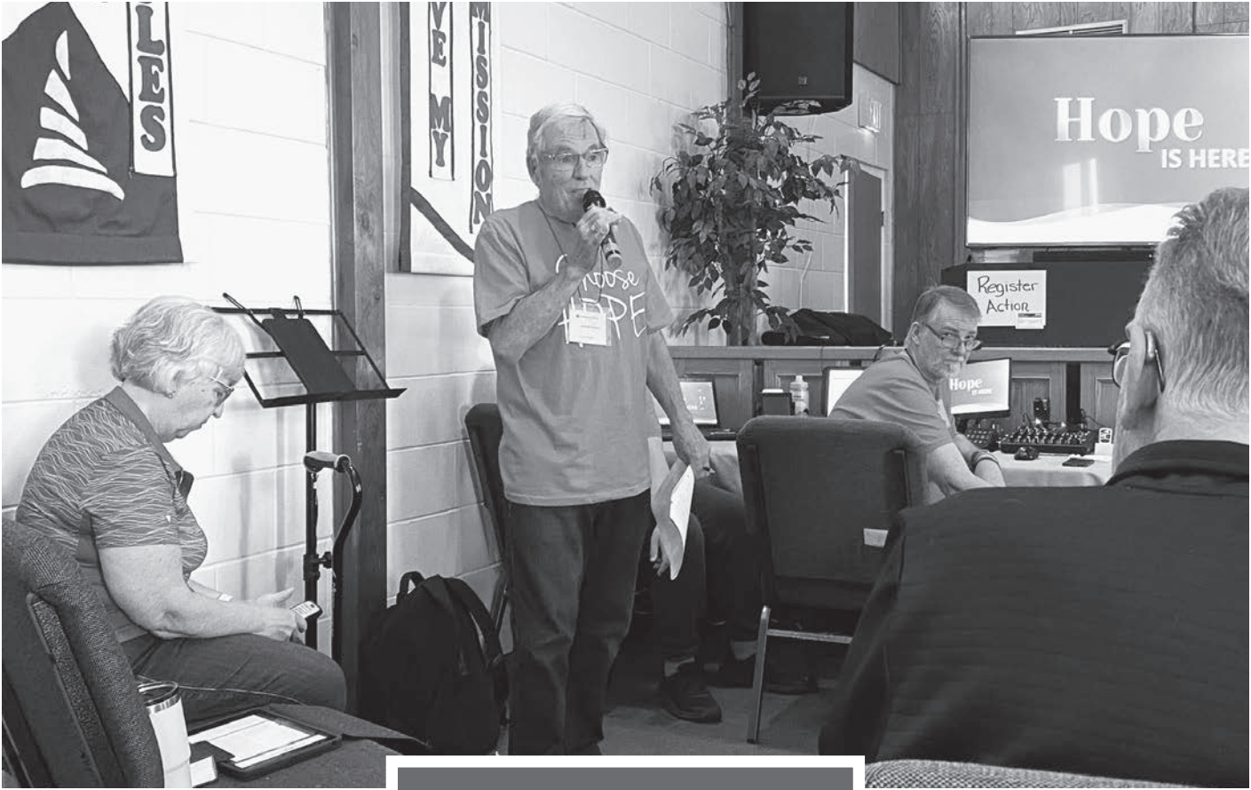
Canada Remote Caucus