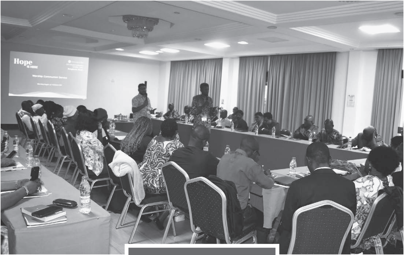
Côte d'Ivoire Remote Caucus