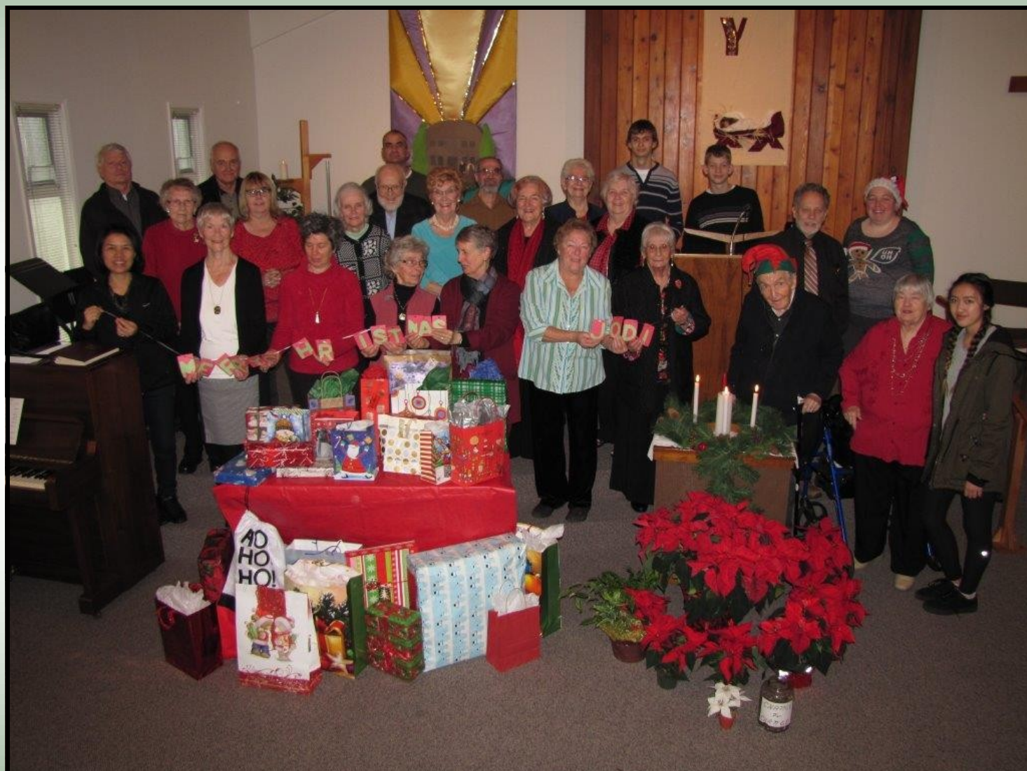
The Victoria Congregation at our annual Christmas Service.